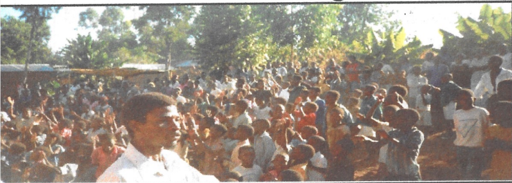
Many raise their hands to become Christians