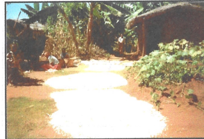
Harvest! drying their corn for the year in the sun.