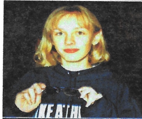
London My eyes were not perfect I came for prayer and how it has helped. I still need glasses but I can see better.