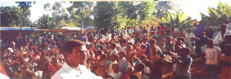
Many raise their hands to become Christians