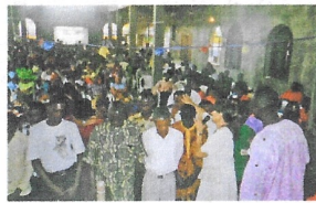
Below: Lagos Outreach