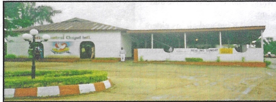
The church from the outside