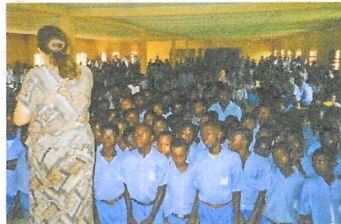
People rise in response to the word.