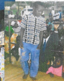
Above. Paralysed boy walks