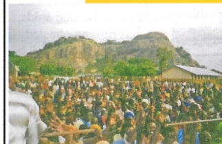
Above. Refugee camp crusades