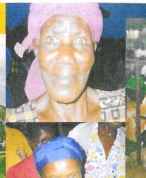
To right: Deaf hear