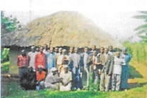
Village people respond to the Gospel due to bicycle ministry.