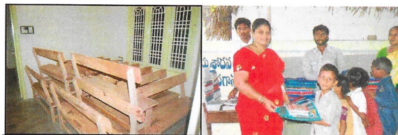
New School desks and books for the orphans