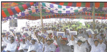
Evangelists showing their certificates, plus books from 'Derek Prince Ministries'.

Up to 1,000 churches are opening a month. We need 1,200 more bicycles at £32 each, to complete the needed bicycles of 2008,