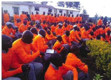
Kitale Prison Kenya 156 Students