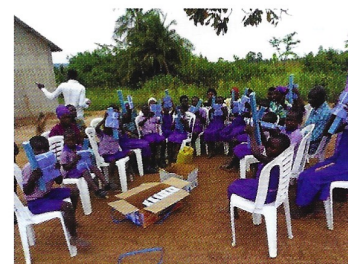
Hoima Orphan children Receiving 3rd Term items

The orphan children have NZ sponsors who pay for their education and care. We still have several orphans who are not sponsored. Sponsorship is $7 per month.