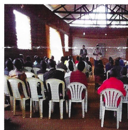
Jinja Class, Uganda 78 Students