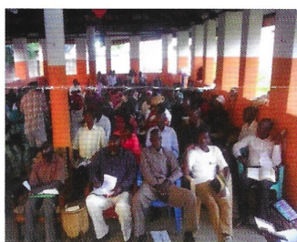
Bugema University, Uganda 102 Students