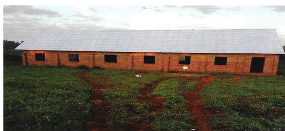
The Hoima Dormitory almost completed, ready for intake next year of older orphan children for trades training.