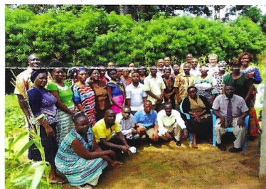
Malindi ,Kenya 67 Students