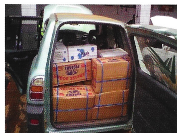
Third Term Distribution